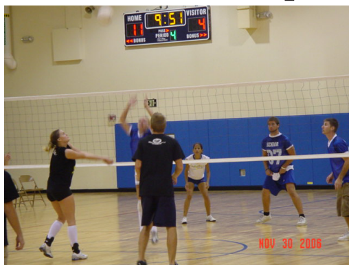
Seniors win Volleyball Competition