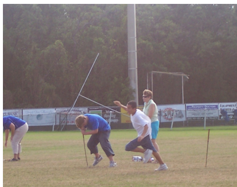
Middle School enjoys Field Day