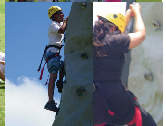
Rock wall climbing : National Guardsman show the way to scale walls by using endurance to reach goals. Middle school students watch with interest and attentively listen to instructions as a guardsman (above) inches upwards. Right: students give it a try.