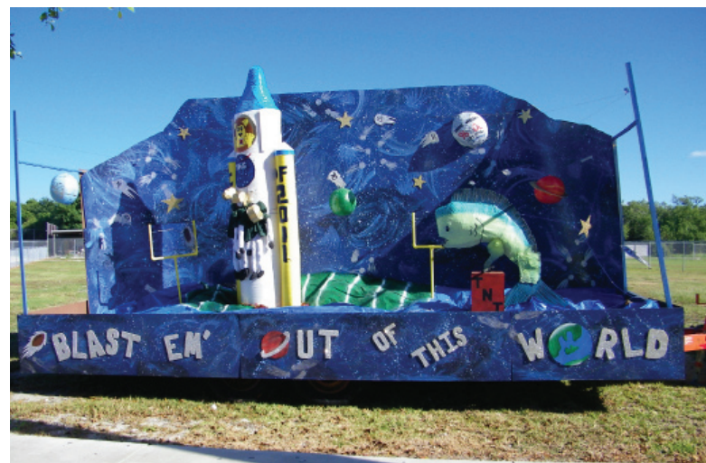
Prize winning float- Junior class 2011