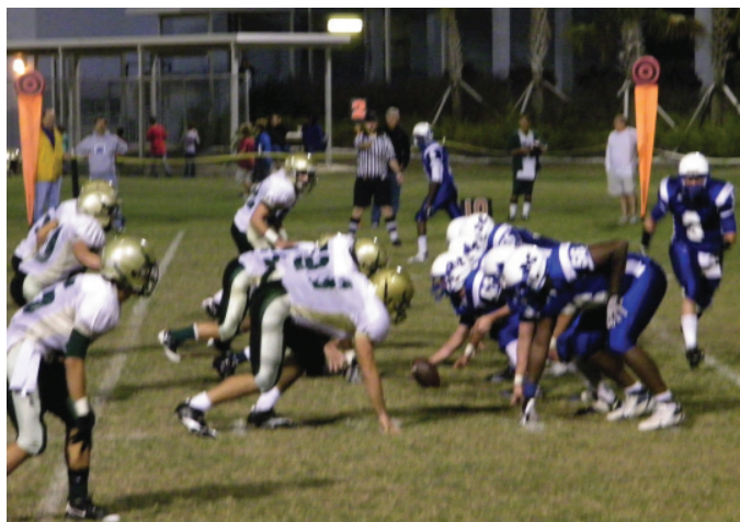
Dolphin's ready for the action at the homecoming game against LaSalle.

At last we had our eagerly awaited homecoming game. This game was also our last game and the MHS team wanted to end the season with a win. The first half was dominated by LaSalle with them scoring three touchdowns in the first half and Marathon scoring none. The second half was much better. Marathon scored a touchdown first but LaSalle responded back soon after. It was still too early to give up so the Dolphins did a couple of good plays and managed to score another touchdown. Overall the game was not a bad one; we saw many good runs and some nice touchdowns. Even though we lost 35-21 we still cheer on our MHS football team and we hope to win next season.