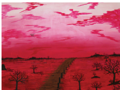
18 x 24 inches, acrylic.

Done as a study in repetition using hues of red, from the lightest pink to the deepest burgundy and dark browns, Deysi creates an eerie serenity which leaves an unsettling feeling in the gut from the many dead leafless trees and the barren dirt road which leads to nowhere in particular.