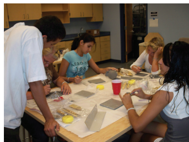
Students in 3D Art work on clay tiles in the new ceramics lab.